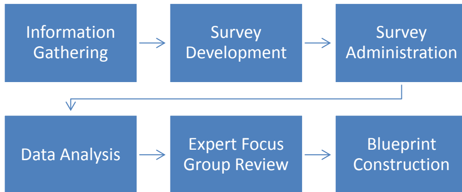
Figure 1. 2016 Practice Analysis Process.